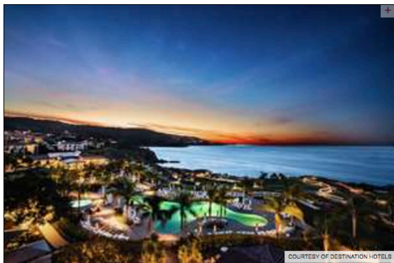
Sunrise at Terranea Resort in Southern California.