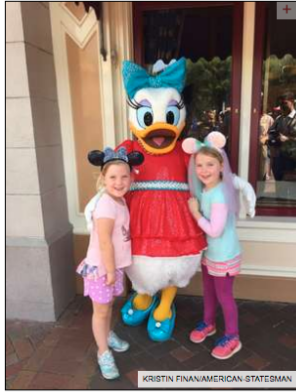
Disneyland is a short drive from Terranea Resort.

honey from the on-property beehives, sea salt from its Sea Salt Conservatory and produce grown in its Catalina Garden.