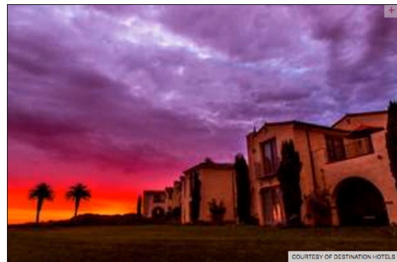
Sunset at Terranea Resort in Southern California.