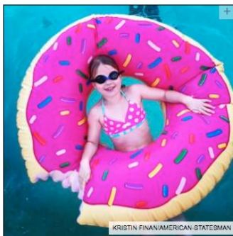
The water feels sweet at Terranea Resort, located outside of Los Angeles.

The highlight for my two daughters, 8 and 5, however, was spying the whales, which you can see from various locations on property from December through April during their annual migration. Make the short walk from the resort to the Point Vicente Interpretive Center and you'll find exhibits on the natural and cultural history of the area with a special emphasis on the Pacific gray whale. In fact, the official whale count is conducted at the center, and resort guests can participate in it through a volunteer program.