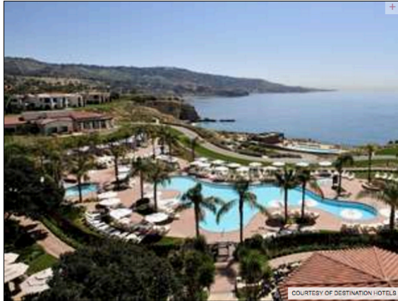
The view from Terranea Resort includes both the pool and the ocean.